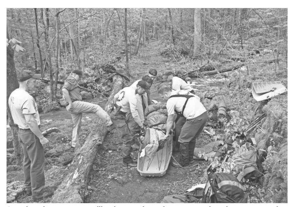
Search and rescue teams, like the one shown here, respond to about 100 search and rescues each year, many of which could be avoided with visitors planning and making responsible decisions.