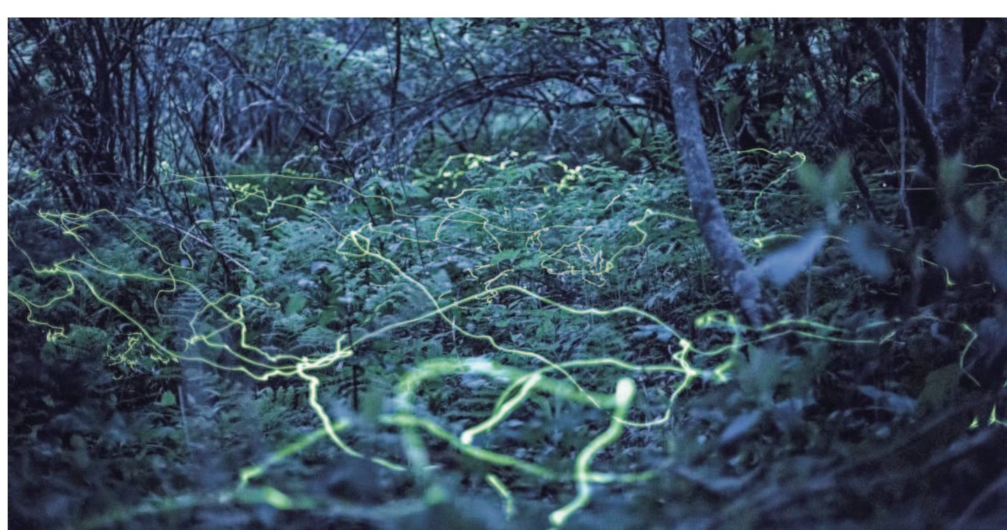
Phausis reticulata, the blue ghost fireflies, hover just above the ground in search of mates, creating an unforgettable eerie yet friendly glow.

"I was happy to be in the Smokies after not being able to come last year," he said. "The fireflies seem to be having a