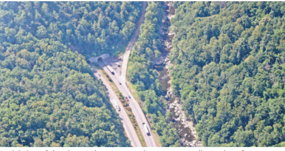
Aerial view of the Pigeon River Gorge, a dangerous 28-mile section of Interstate 40 between Asheville and Knoxville where more than 27,000 vehicles travel daily near Great Smoky Mountains National Park.

The Safe Passage project is an example of road ecology, the study of how life is altered for both plants and animals