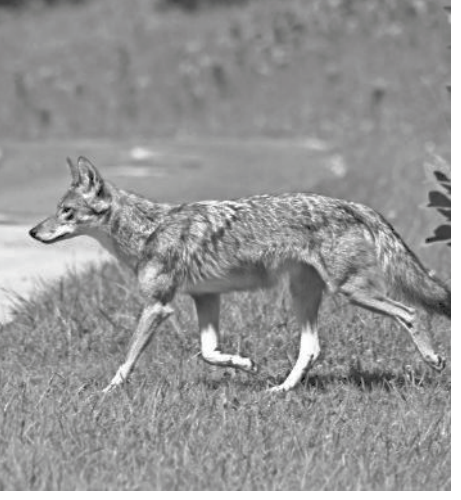
Each time animals like this coyote in Shenandoah National Park decide to cross a road, they risk their lives. When wildlife no longer takes that risk, the road becomes a barrier.

"The project was already designed and moving into construction, so NCDOT was only willing to install two box culverts that could easily be incorporated into the existing plans," he said. "These structures were smaller than what biologists felt the site needed, and a 2008 study showed extremely limited use of the structures by wildlife."