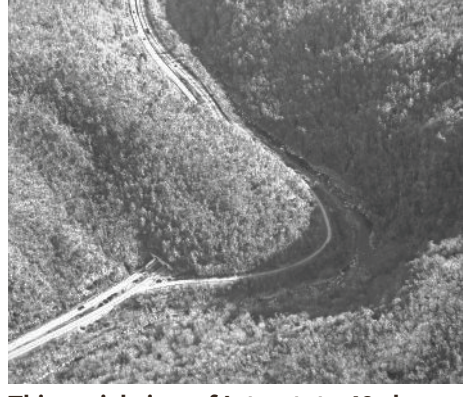
This aerial view of Interstate 40 shows the study area where Travis Wilson has been working in the Smokies lately as part of Safe Passage: The I-40 Pigeon River Gorge Wildlife Crossing Project. Photo made possible by Jake Faber and SouthWings. ANGELI