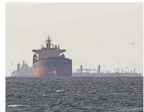
Tankers sail in the Persian Gulf March 11 near the Strait of Hormuz, as seen from the United Arab Emirates. Shipping around the strait has come to a halt since the United States and Israel launched coordinated strikes on Iran on Feb. 28.