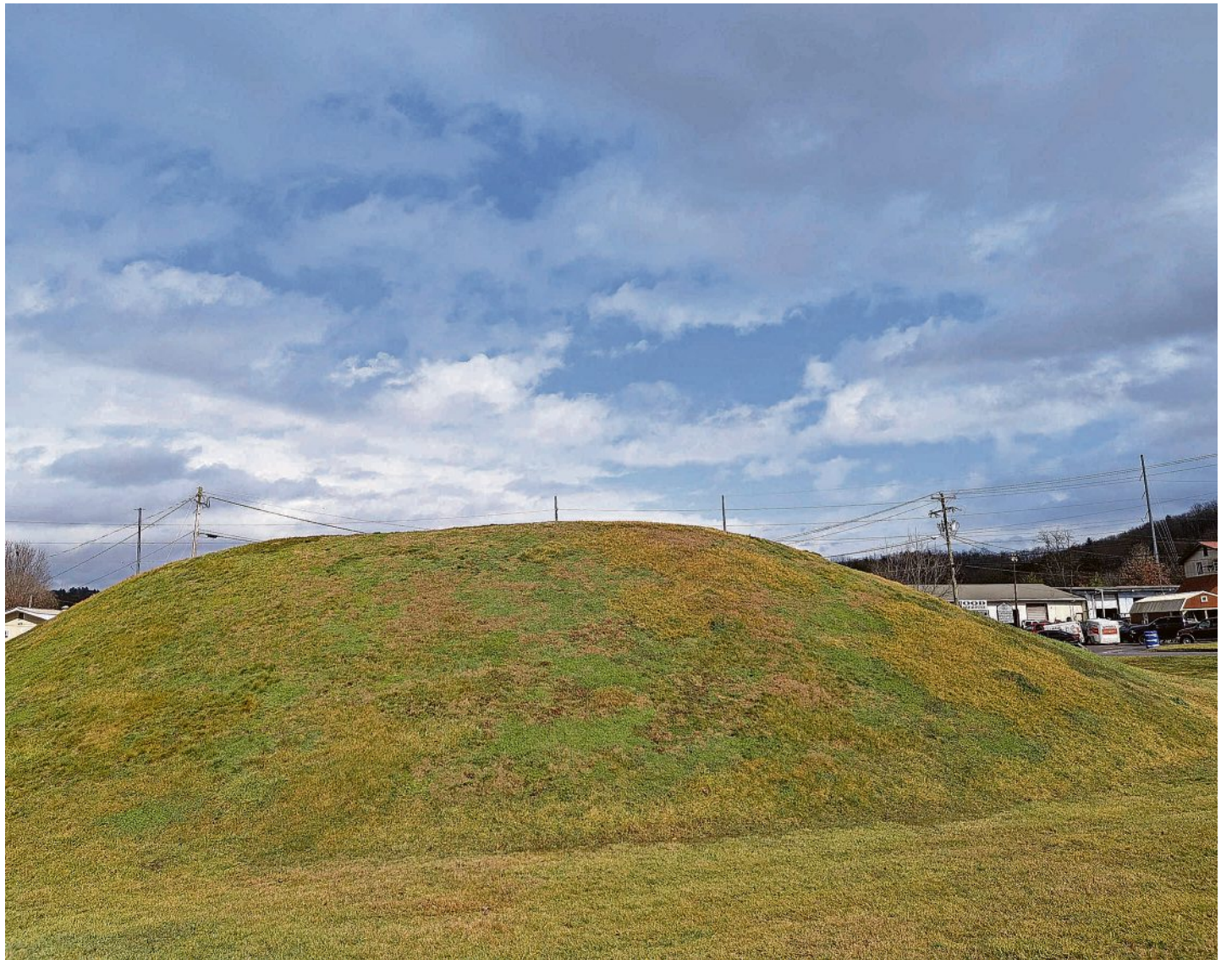
Estimated to be about 1,000 years old, Noquisiyi Mound marked the spiritual and cultural center of the Cherokee community of Noquisiyi, which means "star place."