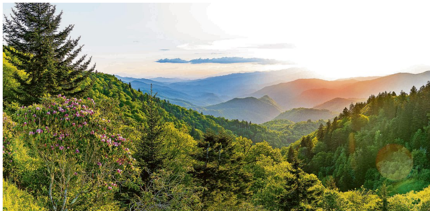
The tallest point in Great Smoky Mountains National Park, Kuwohi is full of majestic views.