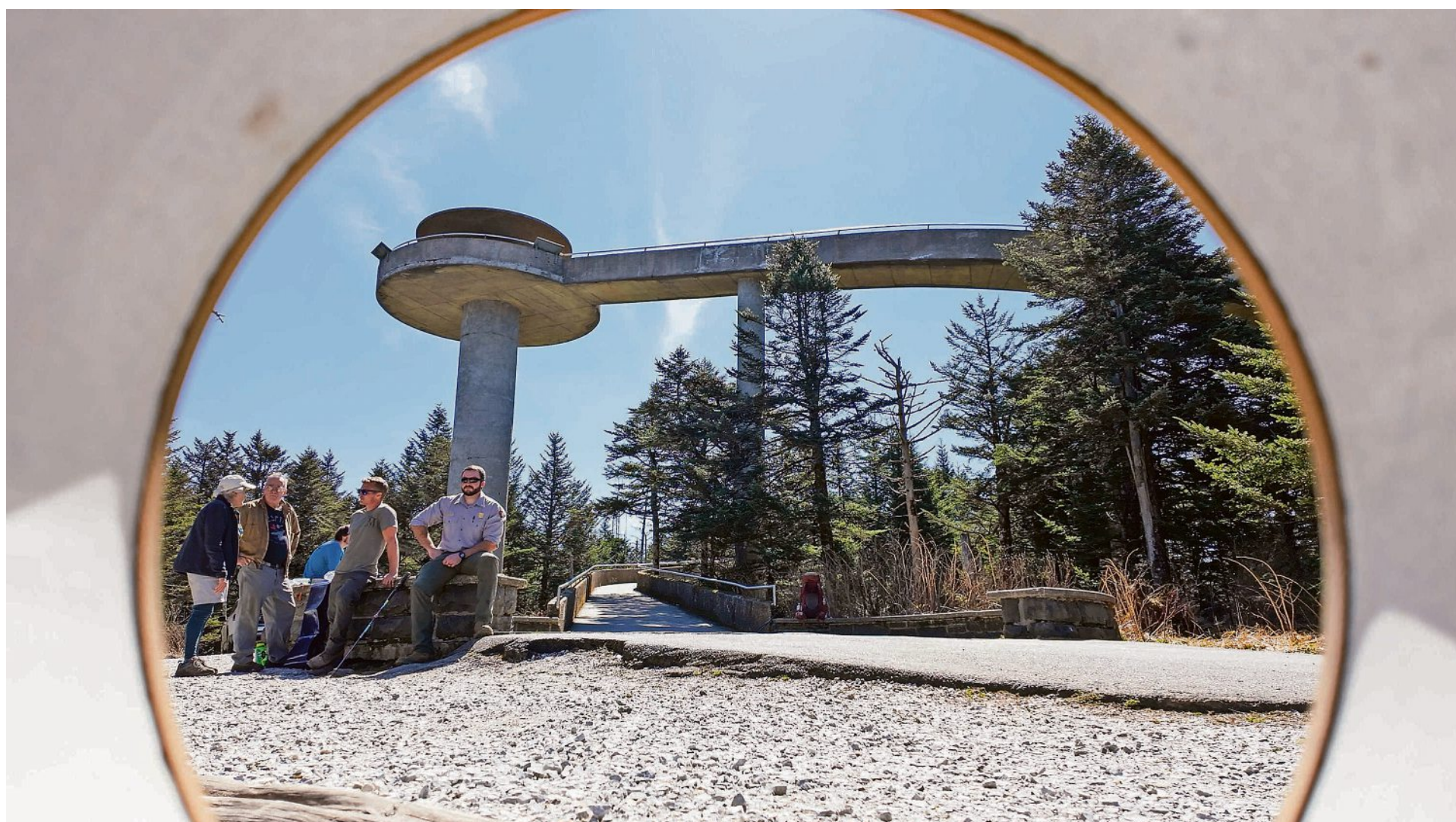
Viewed from behind, the circle cut from the center of the stone marker perfectly frames Kuwohi Tower and, in this photo, the group that journeyed to the summit to install it in March.