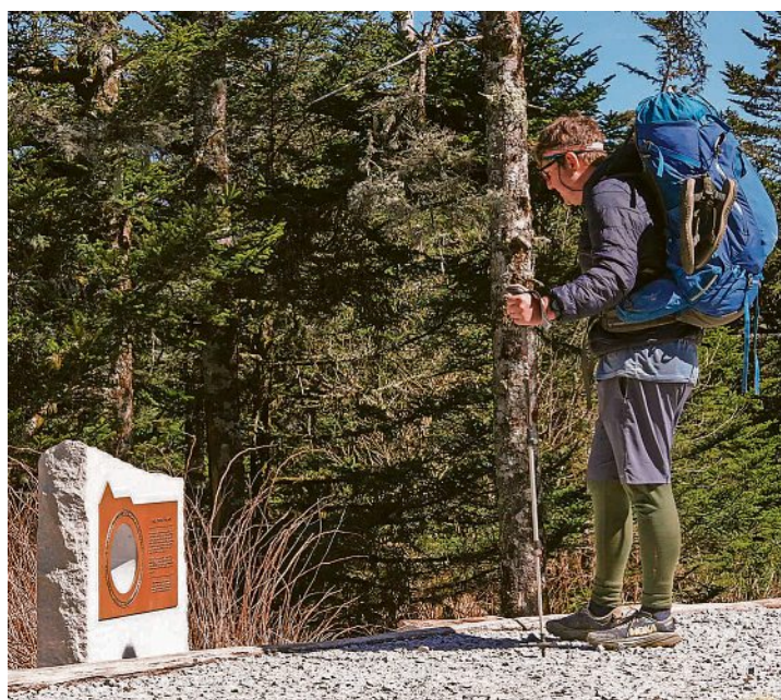
A backpacker pauses in front of the new terminus marker.

“First and foremost,” said Smokies Superintendent Charles Sellars, who opened the ceremony, “Kuwohi is a sacred place to the Cherokee people. . . . Kuwohi is also the highest point in the Smokies, rising to 6,643 feet, and is a beloved destination for visitors seeking views, recreation, and wonder. And beginning today, Kuwohi takes on another layer of meaning. It is now formally marked as the western terminus of the Mountains-to-Sea Trail.”